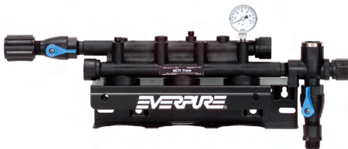
QC71 Triple Parallel Head: EV9272-23

Filter head exclusively for Everpure replacement cartridges